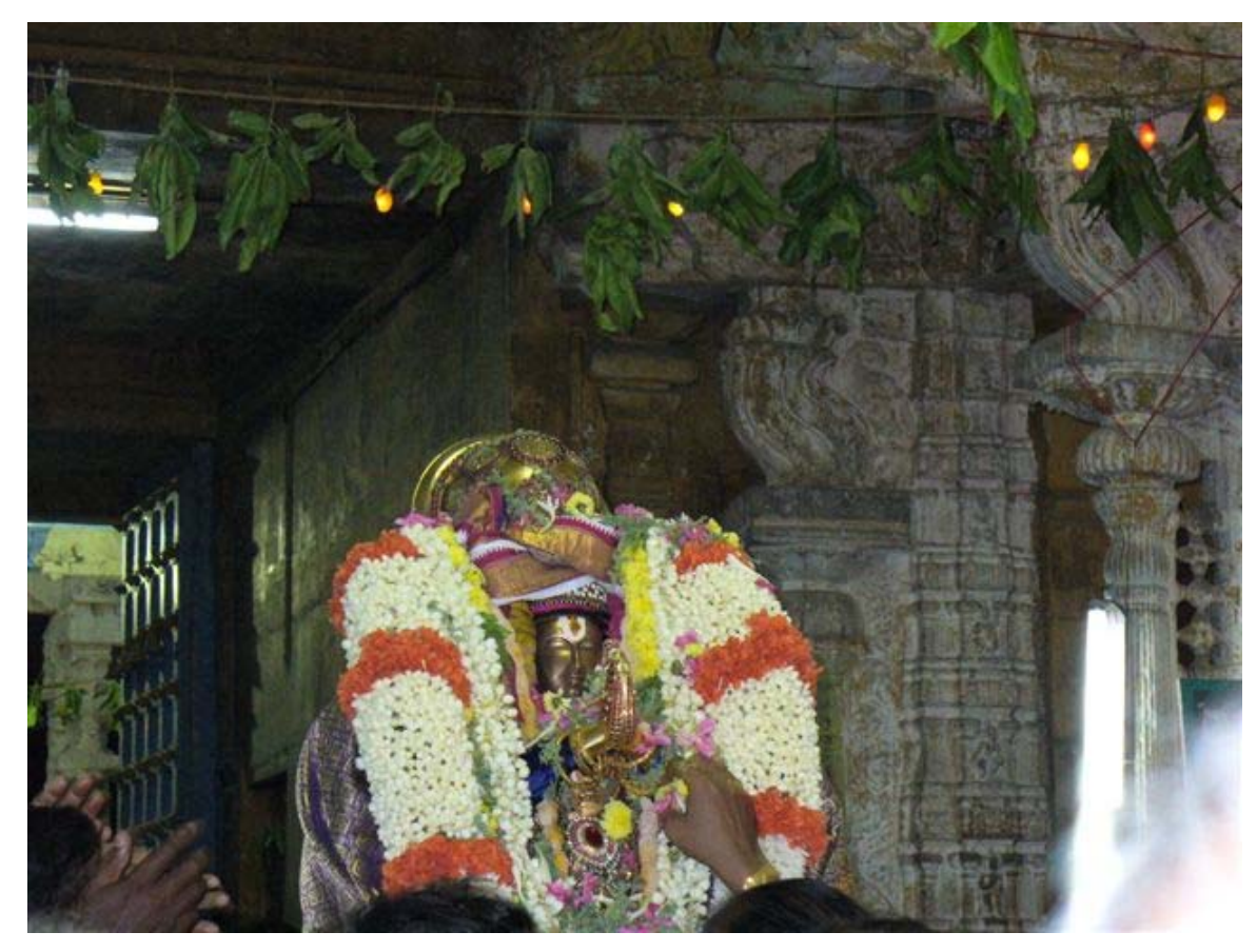
"Svami returning back to Thuppul (vATTam in thirumukham)"

The AakshEpa-SamAdhAnams regarding the meanings of Charama SlOkam are covered here.