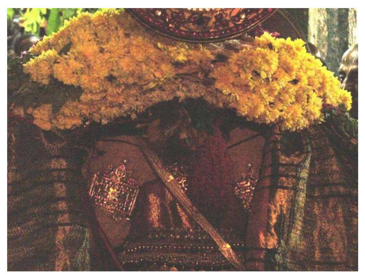
"Chandanam gets wet at Varadan's sannidhi"

The purushArThathva is common to both kainkarya, the service to the Lord and anubhava, enjoyment of His presence, according to the pramANas. When one is mentioned the other is understood.