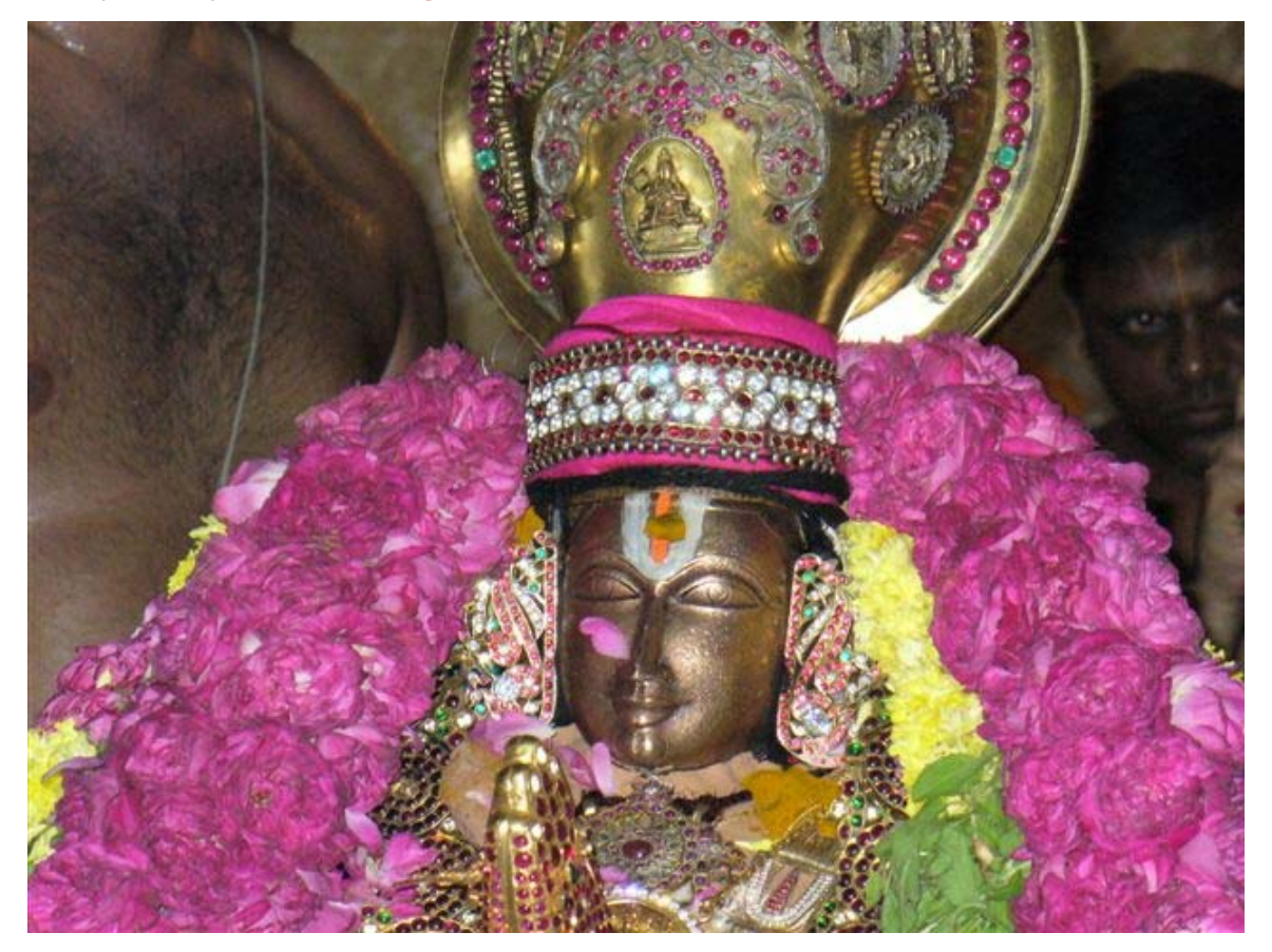
Bashpa bindhu and thiruman starts wetting at the close proximity of Varadan

51. Evam bhagavathah sarvavyApakathvE sathi hEyarupEshvapi anuvarthamAnathvath akhilahEya-prathyaneekathvam aghatitham.