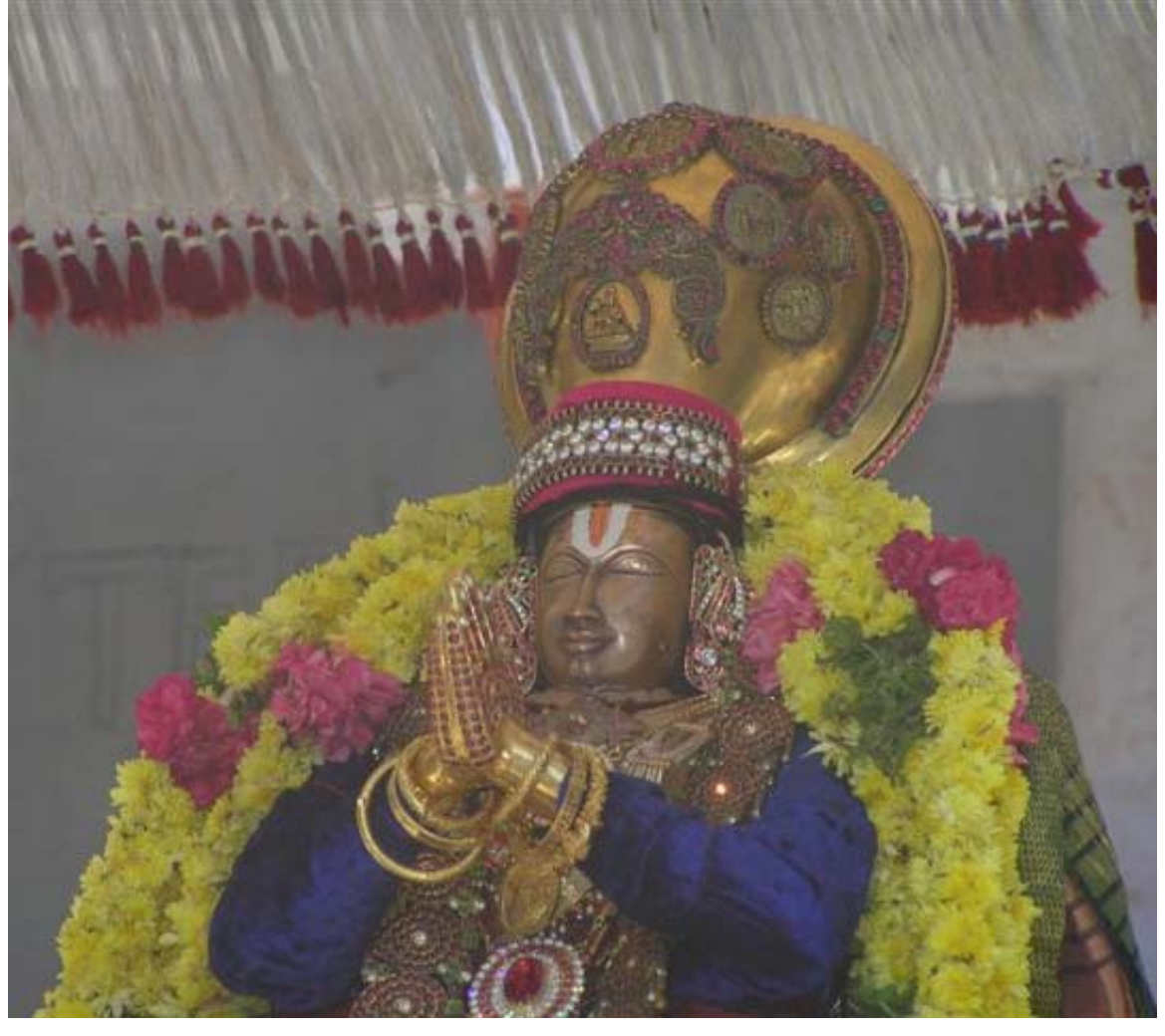
"Svami on reaching Thirukkacchi starts mangalasasanam"

If the Athman is self-illumined it should be present even in deep sleep.